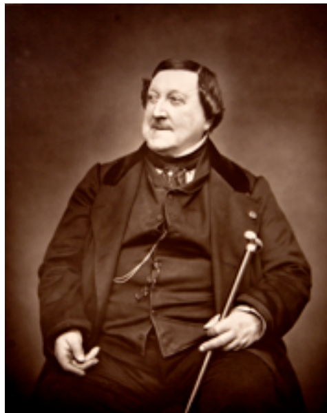
Gioachino Rossini in 1865

For all its success, the opera didn't have an easy birth. It was written in an unbelievably short time. From the start of the libretto arriving to the time of the finished score was three weeks. Rossini wrote non-stop, taking pages out of the hands of the librettist Cesare Sterbini while the ink was still wet and transforming them into the arias we know today. He managed his impossibly tight deadline by borrowing some of the music from his other operas. In fact, one of the most famous pieces from the opera, the overture, had actually been used as the overture for two of his other operas!