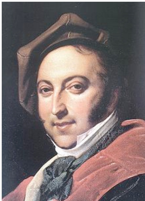
Gioachino (,jō-ə- kē-nō) Rossini in 1820

Legend has it that Rossini shed tears only three times in his life: the first time after the fiasco of his first opera; the second when he heard Niccolò Paganini play the violin; and the third when a picnic basket containing turkey stuffed with truffles fell overboard during a boat trip.